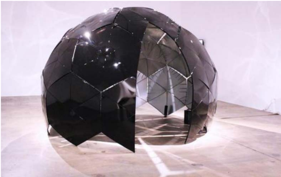
Beatriz Cortez, Black Mirror.