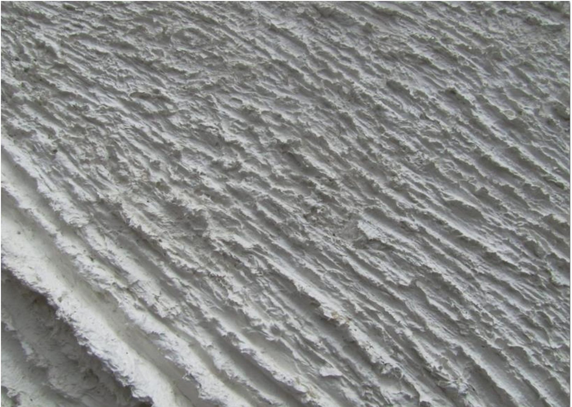
SERENITY, mixed techniques of paper recycling, 150 x 1.12 m. cmariamoz.com.jpg VideoART: https://vimeo.com/159635863