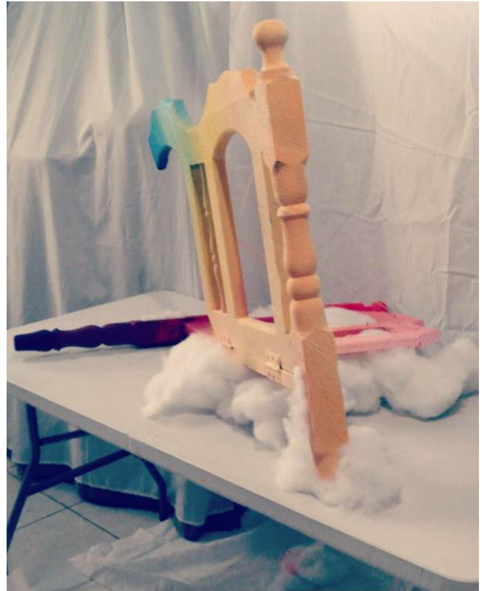
"Rainbow", mixed techniques, restoration, acrylic coloration, assembly, transformation. 2017 .cmariamoz.com.jpg