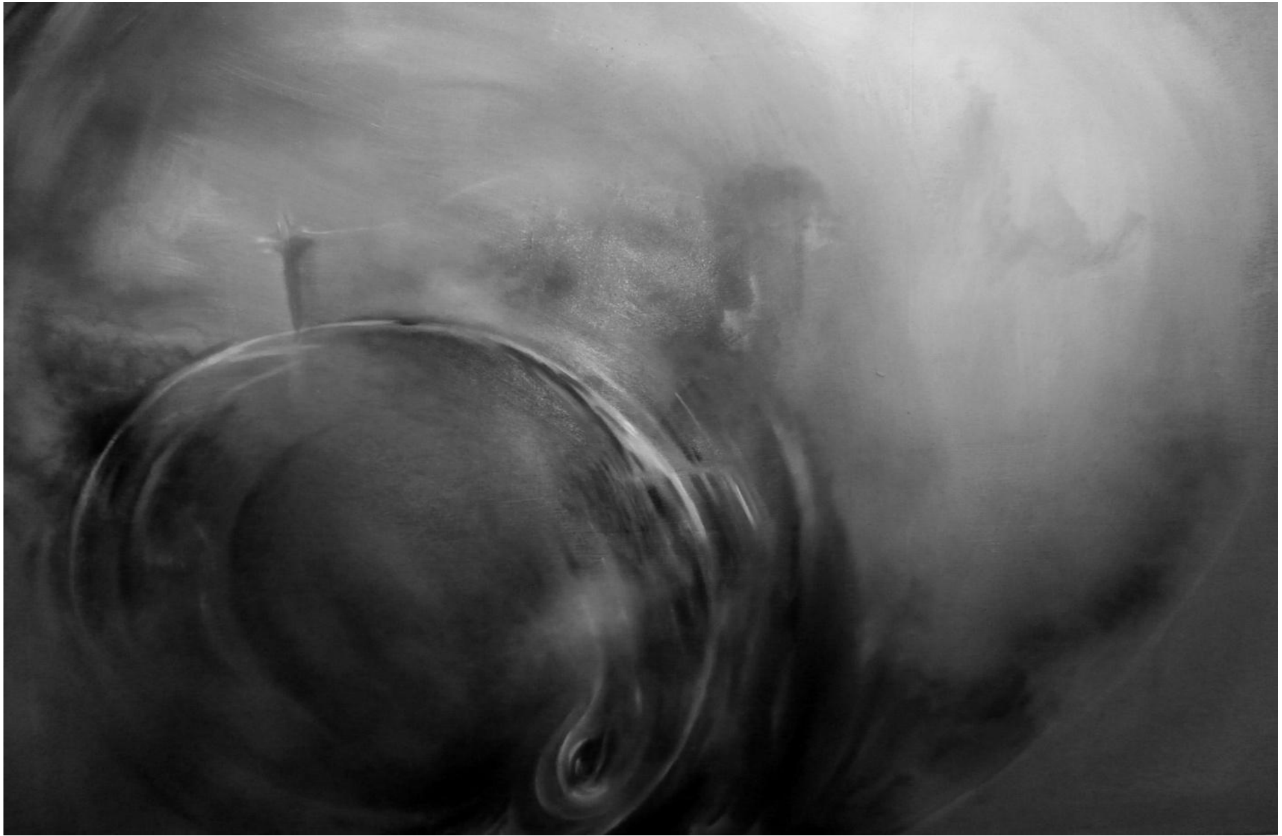
Aesthetic 1. Grisalla, Oil on canvas, 120 x 90 m, 2016. cmariamoz.com.jpg